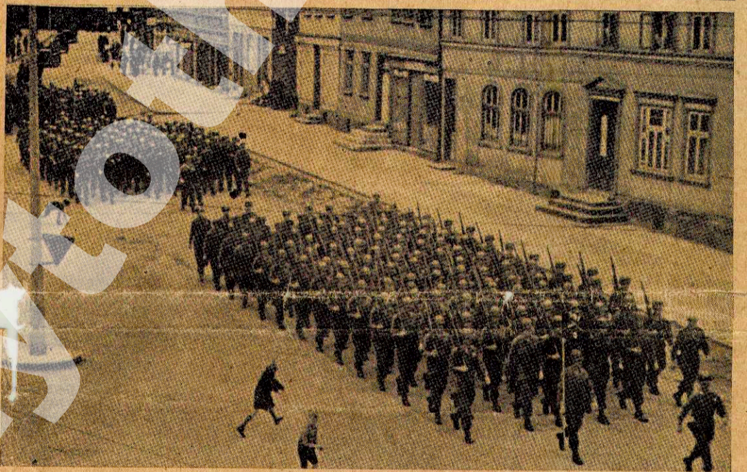
These pictures of 331st doughboys present a vivid contrast to their life a year ago and of today. Leaving the shores of England on D-Day plus 12, they bounced around the rough waters of the channel for two days during a fierce rain storm. Then from the shallow waters of Omaha Beach, came jeeps streaming out of LSTs. Men poured out of LCIs and scrambled onto the shores in waist-high water while others landed on ramps jutting into the channel and marched ashore. At top left, is a typical scene of beachhead activity — the wounded carried to outgoing ships and still more men coming in. At right top, doughboys walk down the ramp to the beachhead to start right off on an all day march to their first assembly area on the continent. In bottom scenes, 331st doughboys, one year later stand in full review and march through the streets of conquered German soil where once the mighty Wehrmacht goosetopped. German civilians and displaced nationals standing in the rear of the parade grounds watch the Yankee ceremonies with mingled expressions of sorrow and joy.